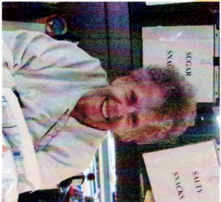
Volunteer of the Month